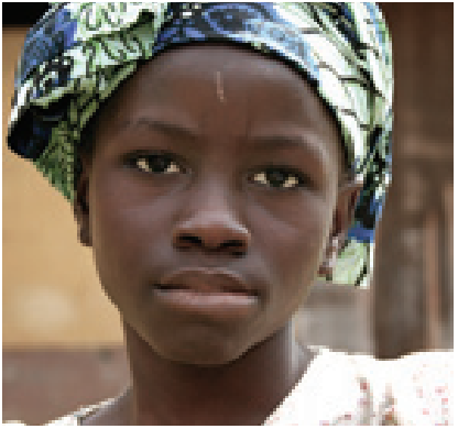
Web-resolution (insufficient for print)

All printed artwork should be in CMYK color mode and output to a PDF for printing. Finished designs should be in a "press-ready" .PDF file.