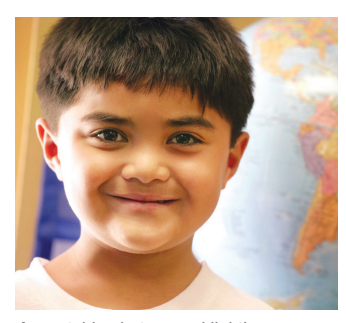
Acceptable photo: good lighting, composition and full resolution

If providing logos and artwork, they should be provided in a vector format where ever possible, to allow scaling and editing without losing quality. This work should also be in CMYK color mode for printing. Vector files should be in an .EPS or .AI file.