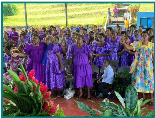
National Ladies Conference

Greetings from the islands of Vanuatu! I am spending the remainder of this term in this beautiful little country, teaching in the Bible School and being involved in whatever I can. Below are a few pictures of the different activities over the past few months since my arrival.