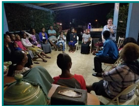
Speaking to the PKs about my experiences as a PK