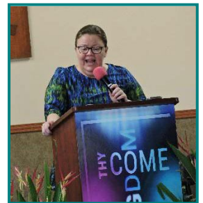
Preaching at the English church