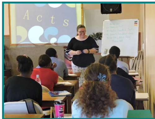
Doing what I love to do: teaching Bible School