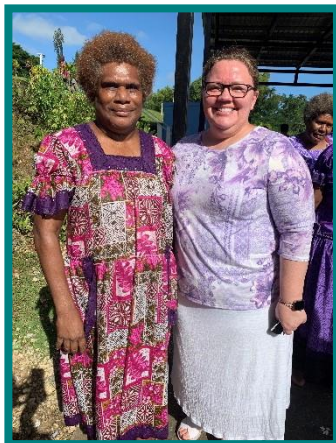
Invited my house girl to Ladies Conference. She came and received the Holy Ghost and was baptized!