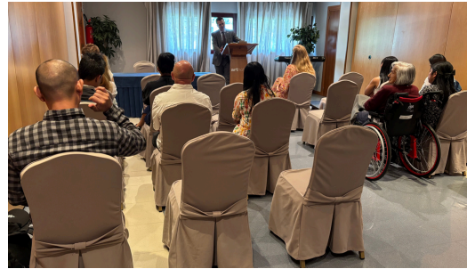
Service in Andorra la Vella