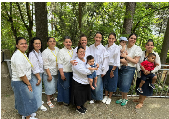
Barcelona area women at the first Pastor's Wives Retreat in Spain